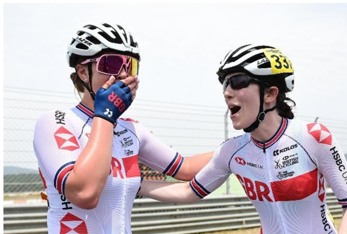
That moment when you realise what you've achieved