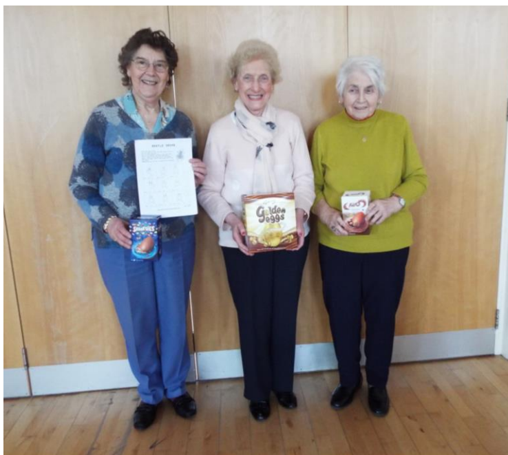
The prize winners at the recent beetle drive

March was the usual riot of competitiveness and laughs, whilst we all tried our best to be the one to call "Beetle" for each round! But at least everyone went home with an Easter egg, even if they did not win the day.