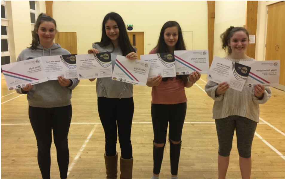
Some of the members receiving their Youth Achievement Awards

The Club is a great way for youngsters to catch up with friends, in a relaxed environment, while taking part in group activities. Sometimes visiting guests come along to teach new skills or trips and outings are organised. Youth club membership is £10 per year, with a £1 charge per night. The tuck shop is reasonably priced.