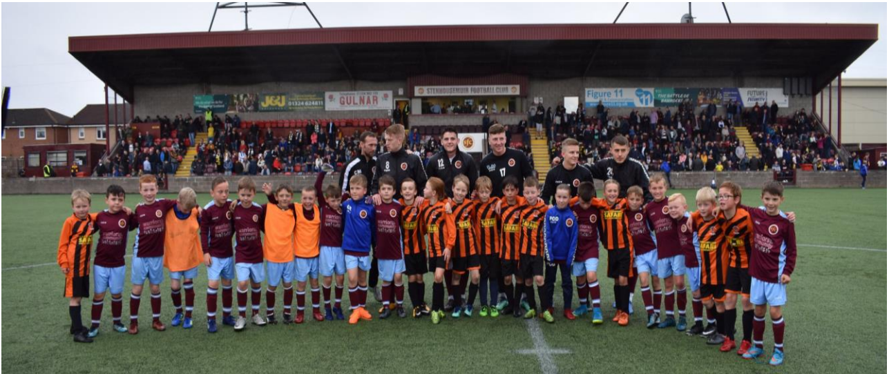
Blair Drummond Tigers in their distinctive orange and black strip

In early September the BD Tigers 2010 football team got an invitation from professional outfit Stenhousemuir FC, to play a friendly match with their 2010 team, at half-time of their league match against Dumbarton.