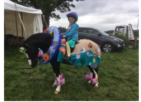
Some of this years competitors

If you are interested in Advertising, Sponsoring or Exhibiting at our Show in 2018 or indeed joining the committee, then get in touch using any of the methods below. Also check out our Facebook and Website for updates as they happen.