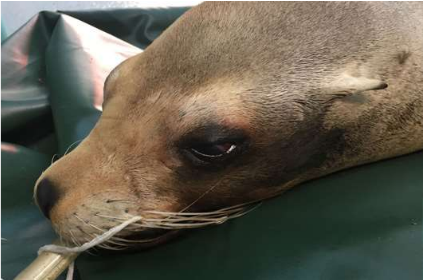
Bella the California sea lion waking up from her operation.

Under general anaesthetic, the cloudy lens was removed from Bella's eye and a clear gel inserted into its place. This will allow Bella to retain some of her vision in that eye and will relieve the pain that she had been experiencing. Before the operation our dedicated keepers Alex, Nikki and Erin had been taking turns to come in early in the morning and staying late at night to ensure Bella was as comfortable as possible, in the run-up to her treatment.